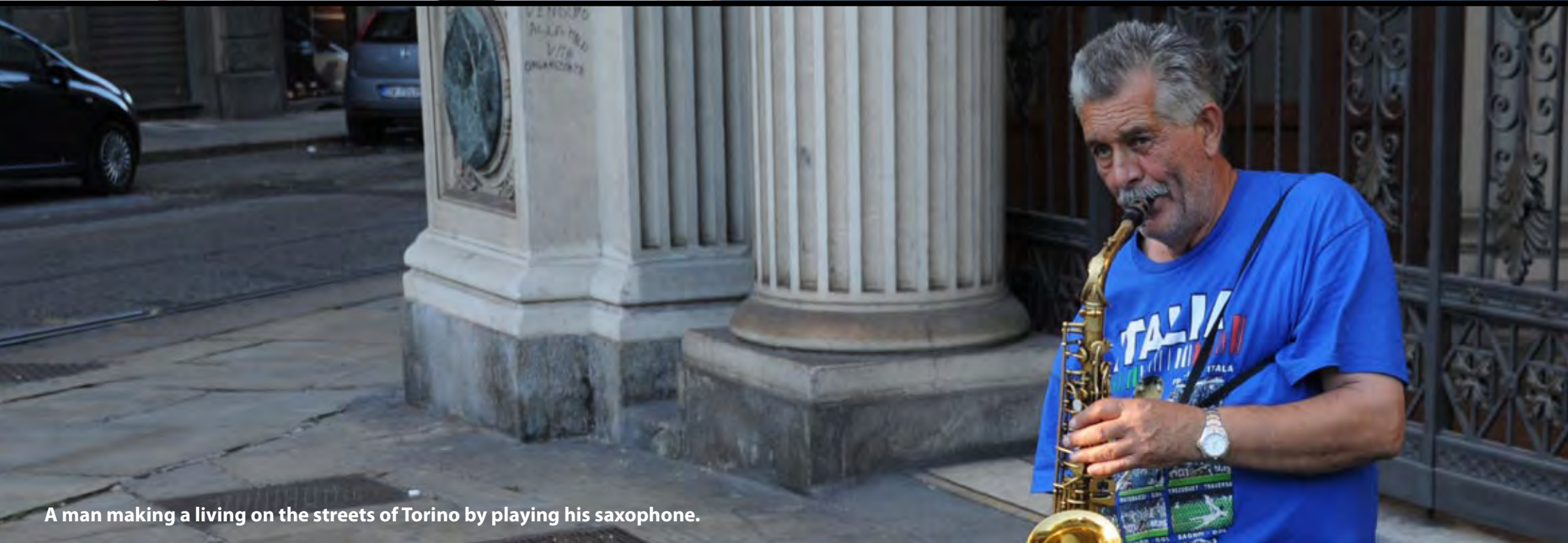
A man making a living on the streets of Torino by playing his saxophone.